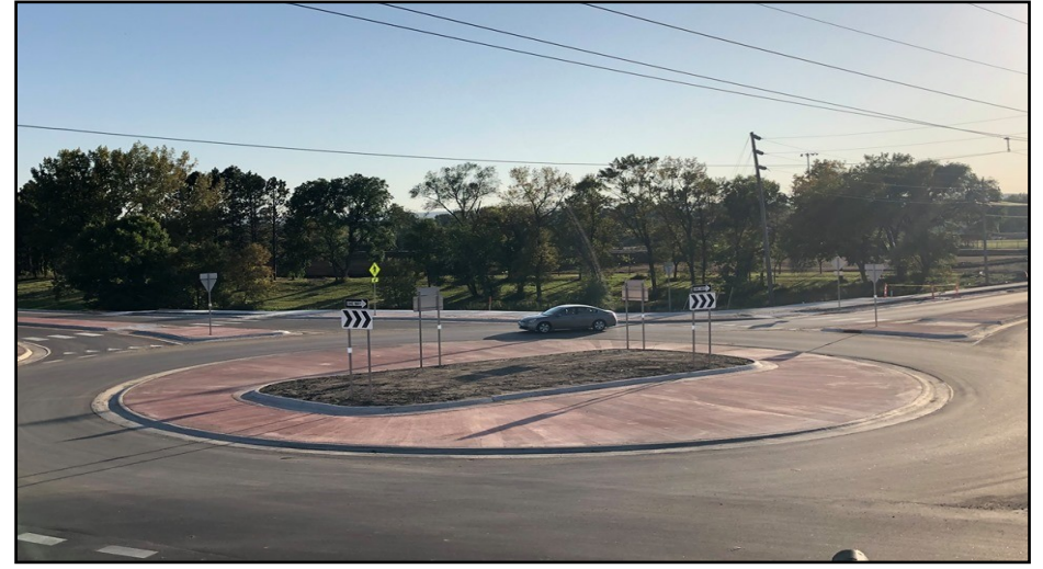
Raised street-level view of the newly-constructed roundabout at the intersection of SD Highway 10 and 8th Ave. E. in Sisseton.