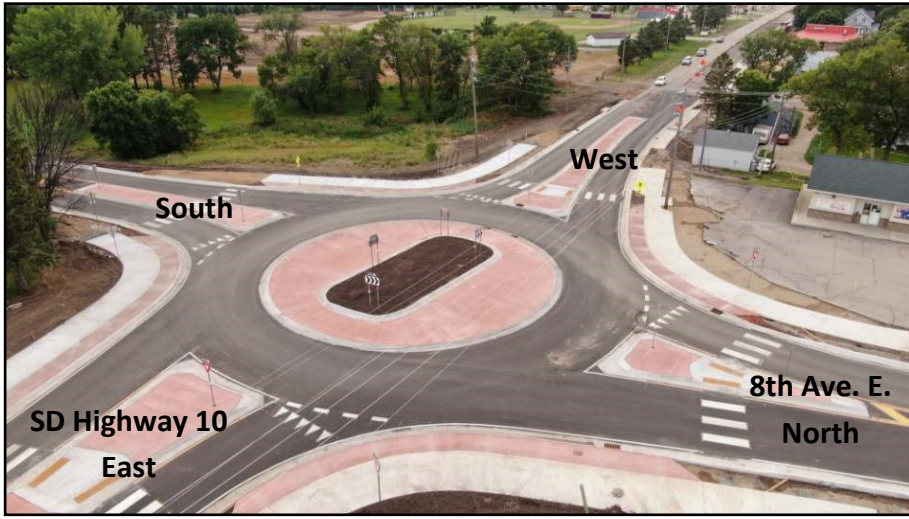
Aerial view of the newly-constructed roundabout at the intersection of SD Highway 10 and 8th Ave. E. in Sisseton.